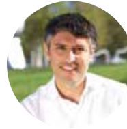
REZA ASLAN Professor of Creative Writing