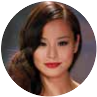
JAMIE CHUNG '05 (Economics)

Performed in The Gifted (2017), Office Christmas Party (2016), It's Already Tomorrow in Hong Kong (2015), Big Hero 6 (2014), Sin City: A Dame to Kill For (2014), The Hangover Part II and III (2011, 2013) and Once Upon A Time (2011).